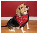
Valentine Doggie Bandana