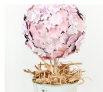
Mother's Day Centerpiece