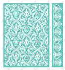
Cricut Cuttlebug™ 5" x 7" Embossing Folder & Border, Pirouette