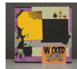
Wicked Witch Layout