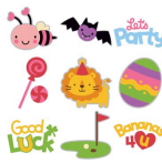
Create a Critter 2 Cartridge