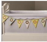
Welcome Crib Banner