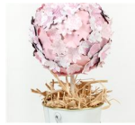
Mother's Day Centerpiece