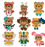
Teddy Bear Parade Cartridge