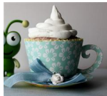
Tea Cup Cupcake Holder