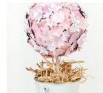
Mother's Day Centerpiece