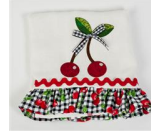
Cherry Dish Towel