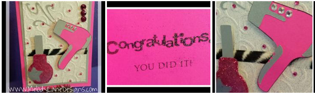
inside of card