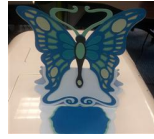
Butterfly Display card