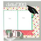
Class of 2012: You did it! Layout