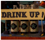
Drink Up Sign