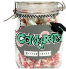
Congrats Smartie Pants Treat Jar