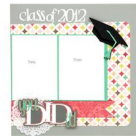
Class of 2012: You did it! Layout