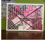
Easy DIY Bulletin Board.