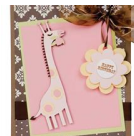
Happy Birthday Card - Giraffe