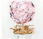
Mother's Day Centerpiece