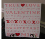
Word Collage Boards