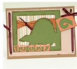
"6 Today' Card