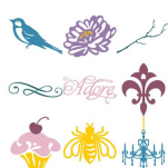
Home Décor Cartridge