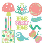
Lovely Floral Cartridge