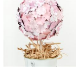
Mother's Day Centerpiece