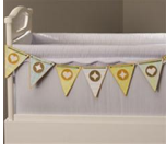
Welcome Crib Banner