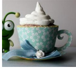
Tea Cup Cupcake Holder