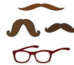
Mustaches & Glasses Digital Set