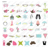
Tie the Knot Cartridge