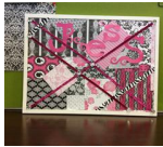
Easy DIY Bulletin Board.