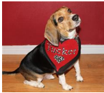
Valentine Doggie Bandana