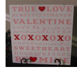
Word Collage Boards