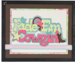
Ride 'Em Cowgirl Frame