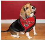
Valentine Doggie Bandana