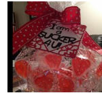
Valentines Sucker Gift Basket