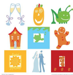
Stretch Your Imagination Cartridge