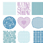
Edge to Edge Cartridge