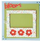
Flower Frame Layout