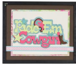
Ride 'Em Cowgirl Frame