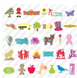
Cricut® Ultimate Creative Series