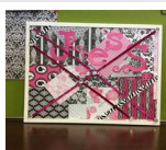
Easy DIY Bulletin Board.