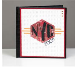
NYC 2009 Mini Album