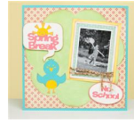
Spring Break Layout