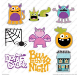
Mini Monsters Cartridge