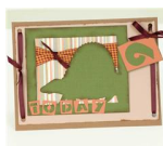
'6 Today' Card