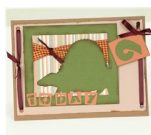
'6 Today' Card