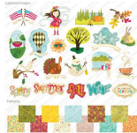
Enjoy the Seasons Digital Set