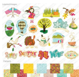
Enjoy the Seasons Digital Set