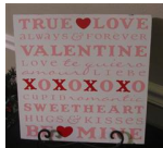
Word Collage Boards