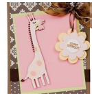
Happy Birthday Card - Giraffe