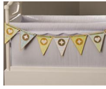
Welcome Crib Banner