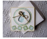
Baby Bottle Card