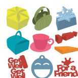
Tags, Bags, Boxes & More® 2 Cartridge