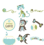
Four Legged Friends Cartridge