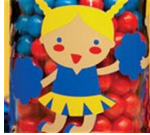
Gum Ball Jar