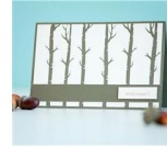
Aspen Trees Welcome Card