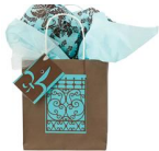
Gate Gift Bag