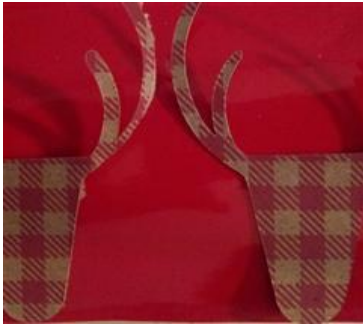
Cut out two images

Cut out two images. I used one of the free cut Christmas Village reindeer. I hid the rest of the image so I could use just the reindeer, size will depend on what you are making these are 2-3".