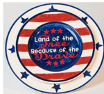
Land of the Free Plate