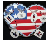
Fourth of July Glass Charms