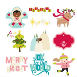
Winter Frolic Cartridge