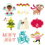
Winter Frolic Cartridge