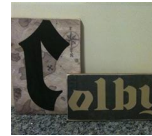
Pirate Name plaque