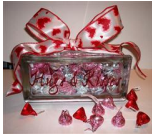
Hugs & Kisses Glass Block