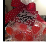
Valentines Sucker Gift Basket