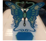
Butterfly Display card