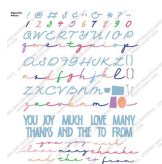
Cricut® Opposites Attract Cartridge