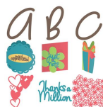
Wild Card Cartridge