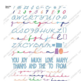
Cricut® Opposites Attract Cartridge