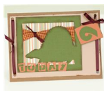
'6 Today' Card