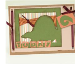
'6 Today' Card