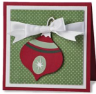
Christmas Ornament Card