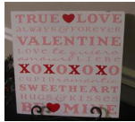
Word Collage Boards