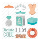
Bridal Shower Cartridge