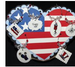
Fourth of July Glass Charms