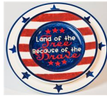
Land of the Free Plate