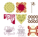
Cricut® Storybook Cartridge