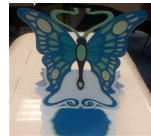
Butterfly Display card