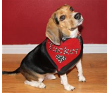
Valentine Doggie Bandana